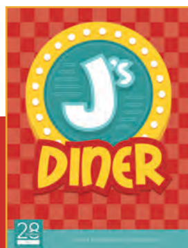
Upper Elementary Leader Guide ISBN 9781628628432