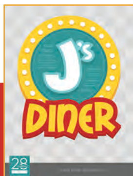
Take Home Resources ISBN 9781628628470