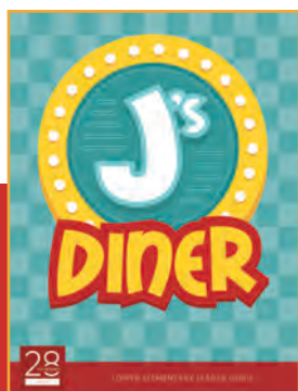
Lower Elementary Leader Guide ISBN 9781628628425