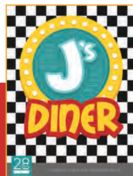
Children's Worship Program Guide ISBN 9781628628456